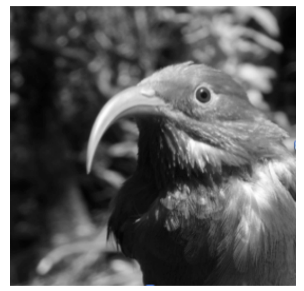
An `I`iwi that the team captured in one of their mist-nets.

"Food web" is just a fancy term for who eats whom in an ecosystem—in this landscape leaves in the forest canopy are eaten by arthropods such as caterpillars, which are eaten by other arthropods like spiders; birds eat both caterpillars and spiders as well as plant material like fruit and flower nectar. When a generalist predator like the black rat is introduced into this system, any and all levels of the food chain can be affected. Black rats eat seeds and seedlings, fruit and nectar, caterpillars and spiders, and will even eat the eggs and young of birds if they can find them. Each member of our team is tasked with determining what impact fragmentation