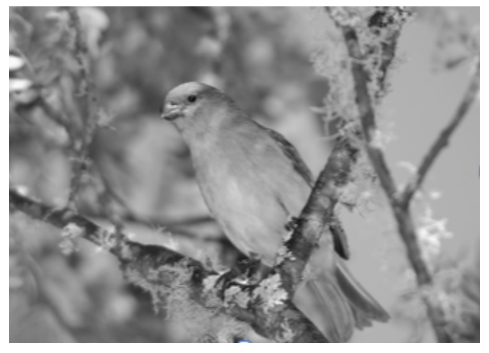
A recent federal court decision ordered DLNR to resume aerial hunts to remove sheep and goats from critical habitat of the Palila, pictured above.

In 1977, the FWS designated the mamane-naio forest on Mauna Kea as the critical habitat of the Palila. By 1978, the mamane forest had been reduced to 10 percent of its historical range by browsing animals. The plaintiffs argued that maintaining a population of destructive feral animals in the Palila's habitat amounted to a "taking" of the Palila within the meaning of the ESA. Federal District Court Judge Samuel P. King agreed and ordered the State to adopt a program designed to eradicate the feral sheep and goats from the Palila's critical habitat and enjoined the State from taking any action which has the effect of increasing or