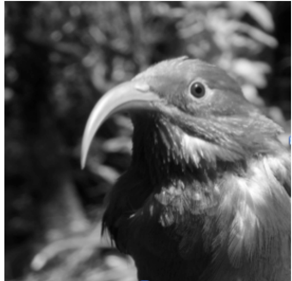
An ʻIwi that the team captured in one of their mist-nets.

“Food web” is just a fancy term for who eats whom in an ecosystem—in this landscape leaves in the forest canopy are eaten by arthropods such as caterpillars, which are eaten by other arthropods like spiders; birds eat both caterpillars and spiders as well as plant material like fruit and flower nectar. When a generalist predator like the black rat is introduced into this system, any and all levels of the food chain can be affected. Black rats eat seeds and seedlings, fruit and nectar, caterpillars and spiders, and will even eat the eggs and young of birds if they can find them. Each member of our team is tasked with determining what impact fragmentation