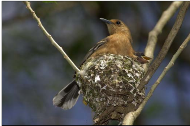
Tinian Monarch at its nest