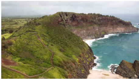
Kilauea Point.