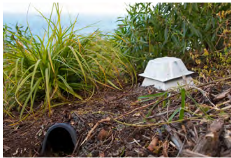
Artificial burrow designed for nesting seabirds.