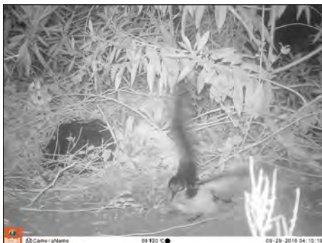
A Newell's Shearwater chick exercising its wings outside of its burrow.