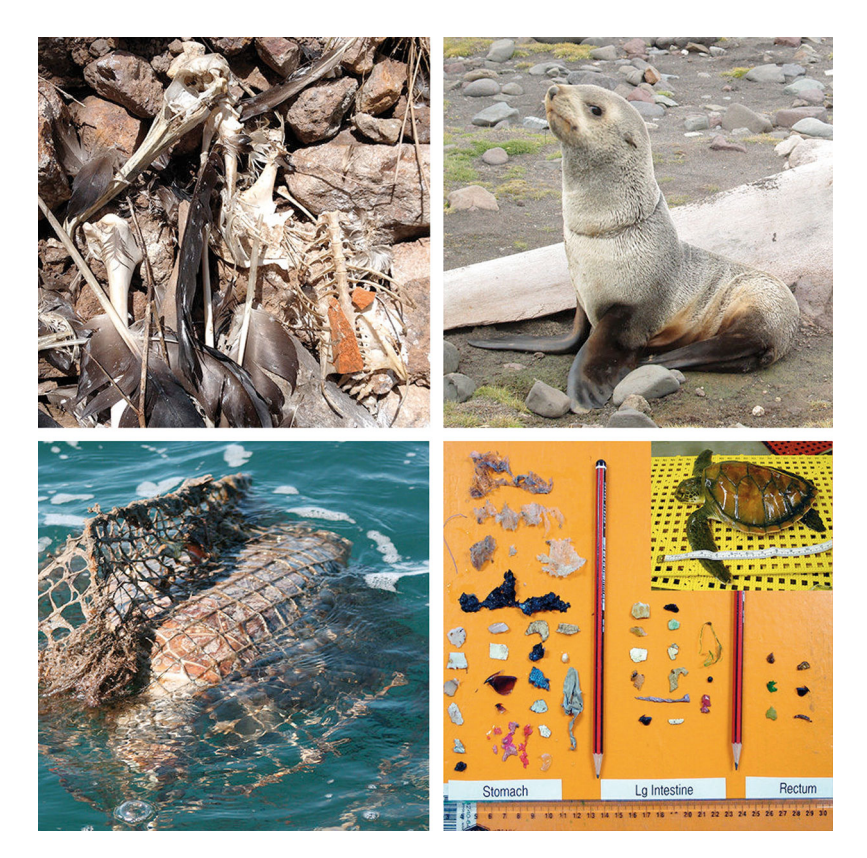
Fig. 3. Top left to bottom right—magnificent frigatebird Fregata magnificens carcass from Battowia Island, Grenadines, with orange foam contained within stomach; Antarctic fur seal Arctocephalus gazella , with plastic ring entanglement at King George Island, Antarctica; juvenile green turtle Chelonia mydas trapped in discarded crab trap and plastic fragments recovered from the gut of a juvenile green turtle

When taken in conjunction, it is clear that plastic pollution is impacting food webs through ingestion