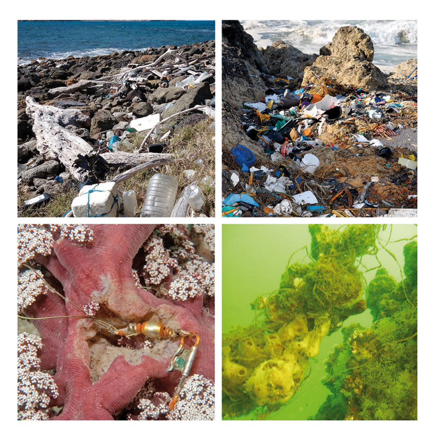
Fig. 2. Clockwise from top left—beach debris from a remote beach on Catholic Island, Grenadines (courtesy Jennifer Lavers); debris accumulation on an urban beach (Stradbroke Island, Australia) (courtesy Kathy Townsend); entanglement and damage to soft coral by fishing line (courtesy Stephen Smith); and fishing line entanglement of a pier with algae and sponges growing on it (courtesy Kathy Townsend)

Quantifying the impact of plastic pollution on the physical condition of habitats has received little attention (but see Votier et al. 2011, Bond & Lavers 2013, Lavers et al. 2013, 2014) relative to the impacts of plastic pollution on organisms (e.g. Derraik 2002, Gregory 2009). However, in intertidal habitats, accumulation of plastic debris has been shown to alter key physico-chemical processes such as light and oxygen availability (Goldberg 1997), as well as temperature and water movement (Carson et al. 2011). This leads to alterations in macro- and meiobenthic communities (Uneputty & Evans 1997) and the inter-