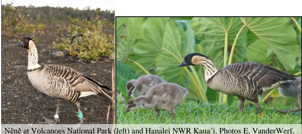
Nēnē at Volcanoes National Park (left) and Hanalei NWR Kaua'i.

Population Size and Trend: In 2011, the Nēnē population was estimated to be 2,465-2,555 birds, including 416 on Maui, 83 on Moloka'i, 1,424-1,514 on Kaua'i, and 542 on Hawai'i (Nēnē Recovery Action Group, unpubl. data). The total population has increased since 2005, when the number of birds was estimated to be 1,754. This increase was caused largely by growth of the Kaua'i population, which grew from 829 birds in 2005 (USFWS 2011). Populations on other islands have been stable or increased slightly, despite periodic releases of captive-bred birds. The Nēnē population was reduced to an estimated 30 wild and 11 captive birds in the late 1940s (Smith 1952, Kear and Berger 1980). In 2011-2012, 292 Nēnē were removed from areas near the Līhu'e Airport on Kaua'i to reduce the risk of bird-aircraft strikes, of which 239 were moved to Hawai'i and 30 were moved to Maui, where they eventually will be released (Hawai'i Division of Forestry and Wildlife [DOFAW] 2012).